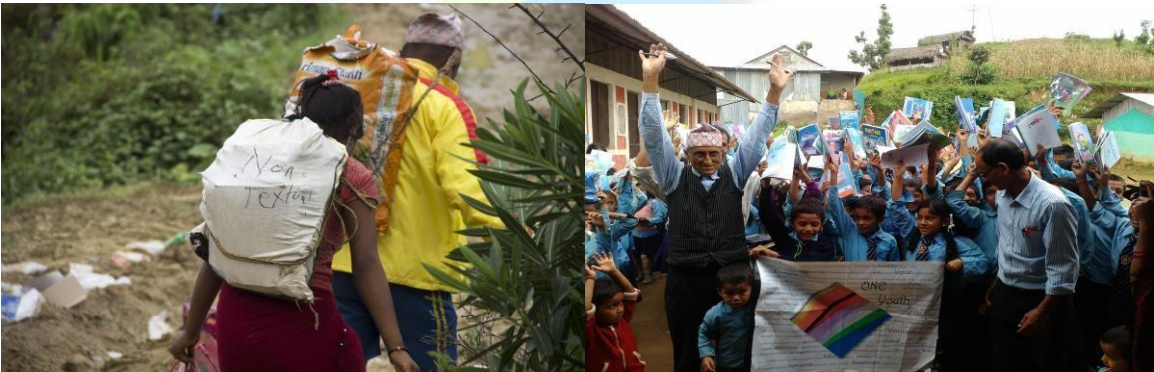
4.4. Buddha Primary School, Simalpani-05, Arghakhanchi.