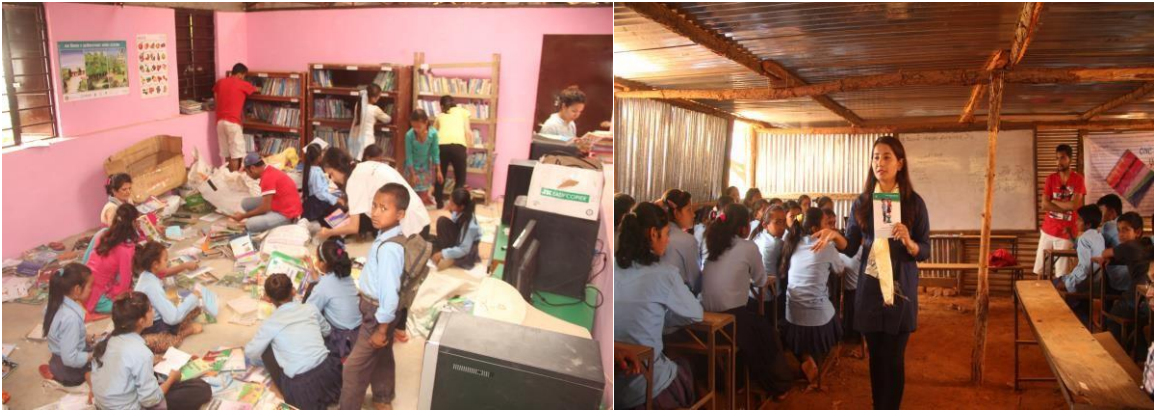
4.3. Rikot Lower Secondary School, Rikot, Arghakhanchi.